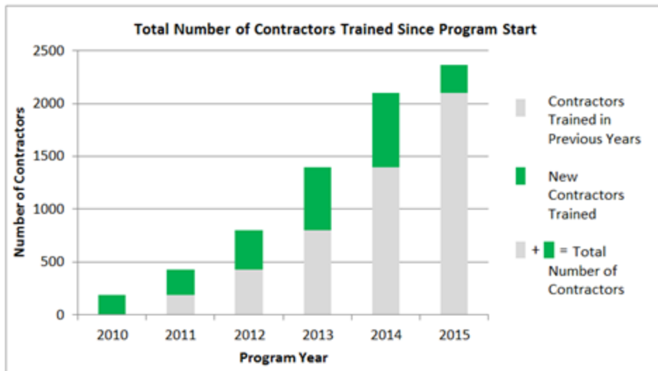
Figure 2. Growth of trained contractors

The number of installations that have been completed as a result of the HVAC SAVE program has grown substantially through the years as well, as seen in Figure 3. In 2012, there were 1,156 VQIs submitted in the software, whereas in 2014, the first year HVAC SAVE was required for customer rebates, there were 24,000 HVAC SAVE VQIs completed. There were 39,112 VQIs completed for calendar year 2015. The installations completed in 2014 have an average HVAC SAVE equipment score of 95.8 and have an average HVAC SAVE system score of 76.8. The average equipment score of 95.8 is over 25 points higher than the baseline equipment average of 70.